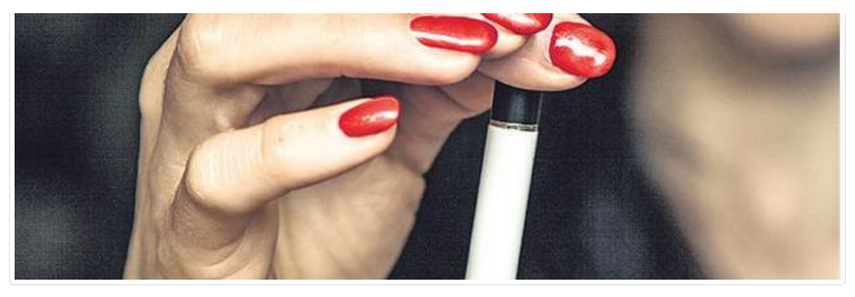
While recent research proves that vaping can be just as addictive as smoking, we look at myths surrounding the use of e-cigarettes.

In a new study published in the American Chemical Society's journal, Chemical Research In Toxicology, researchers suggest that the e-cigarette may be just as addictive as its real counterpart.